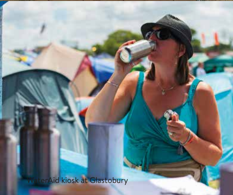
WaterAid kiosk at Glastonbury