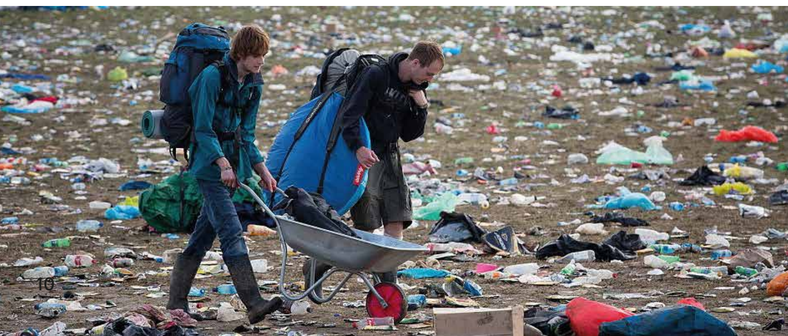
Image: Plastics have become a surprisingly hot topic in the media, and audiences may be expecting their festival to act on this issue. After negative national attention on the waste left at the end of events in recent years, and the widespread actions being taken across society on plastics, it may be prudent for festivals not to be left behind.

The vibe: Behavioural studies suggest that the disposability of plastics can promote a lack of individual responsibility for the shared environment, which may have implications for the atmosphere, the potential for damage, and overall costs of managing the event and clean up.