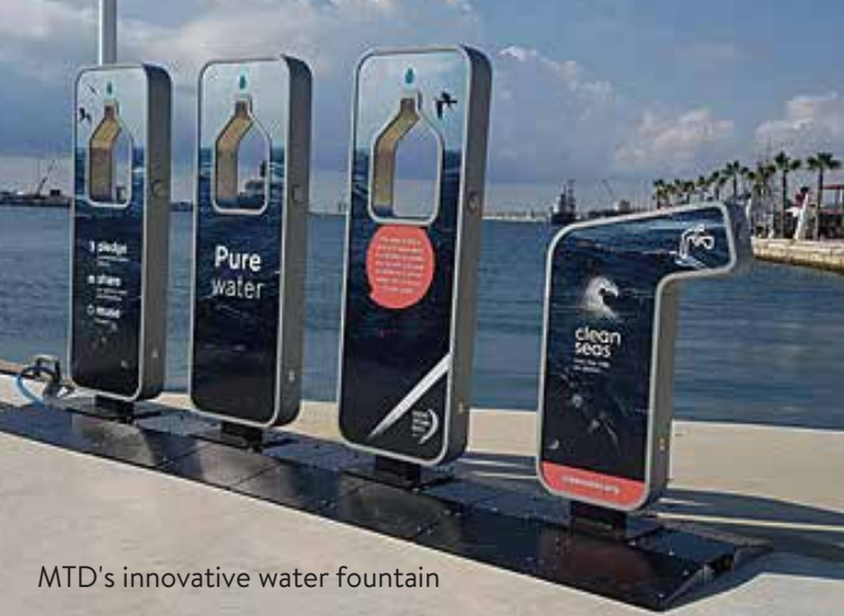
MTD's innovative water fountain

cups for drinks. Return baskets for dirty's were placed on stalls, and extra volunteers were recruited to keep momentum with washing at a central station. People responded really positively on being given "proper" plate, and although there were some losses, most were handed back. They saved time and money on disposables, waste management and skips, and plans are afoot to tweak the initiative in 2018.