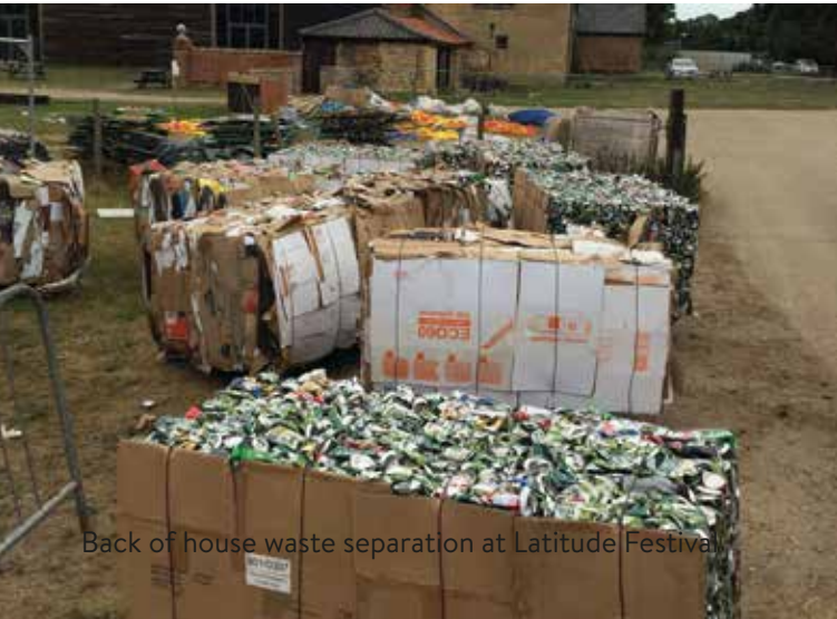
Back of house waste separation at Latitude Festival